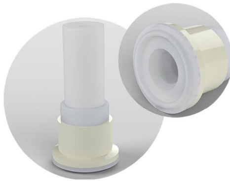
DN 20 TC