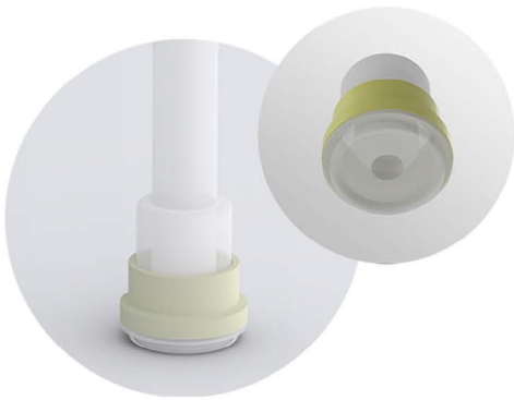
3/4" TC MINI

For Pharmaceutical and Biotech Applications